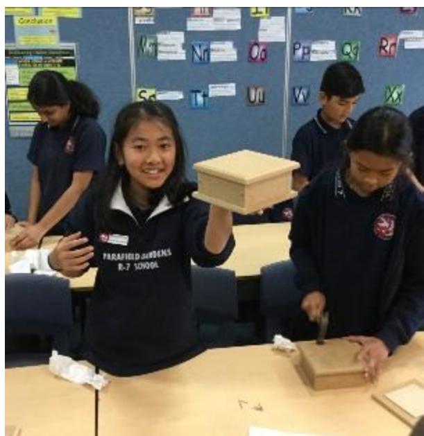
Concentrated effort - and the finished product!