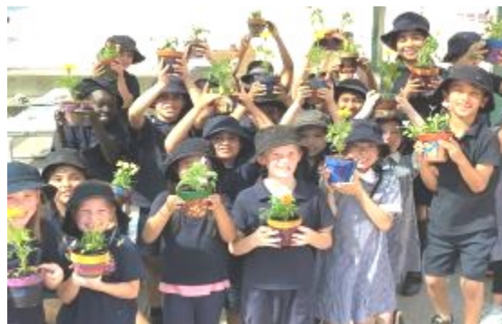
Students from Room 32 loved making their presents for Mothers' Day