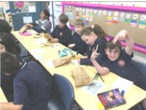
Learning about adjectives using popcorn!