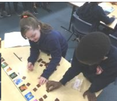
Investigating division by sharing chocolate squares between Disney characters.