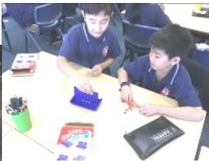
Playing some games to finish the term!