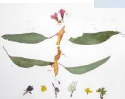
I made a picture of a butterfly. I used leaves for the wings and flowers for the feelers.