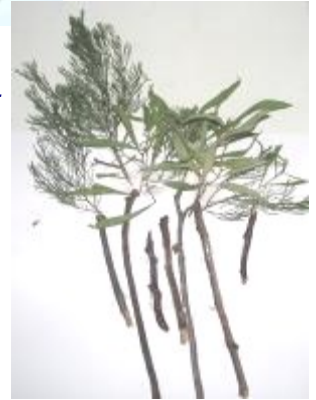
I made a forest of trees. Saish