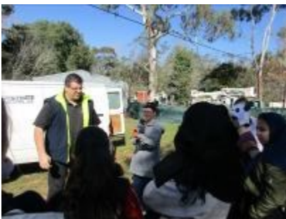
Learning how to play Laser Skirmish