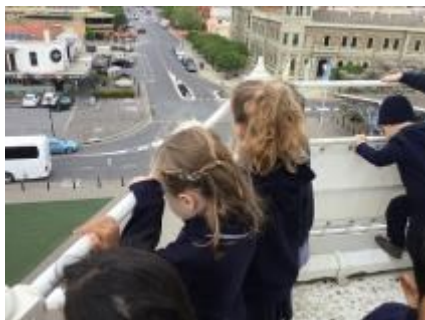
We were very high up when we climbed the lighthouse!