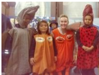
Some of us dressed up as sea creatures when we visited the Rock Pool.