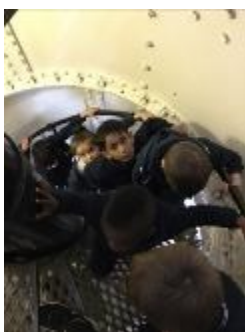
The steps in the lighthouse were very curly! It was a bit scary!

We learnt how to go up the spiral staircase in the lighthouse and how to go backwards down the steps on the boat. We learnt that dolphins can swim backwards on their tails and that their dorsal fin (on their back) has no bones in it. They blow water out of their blowhole which is on the top of their head.