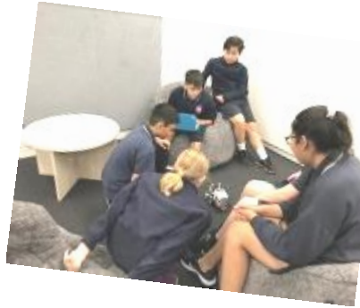
Coding with Lego Mindstorm