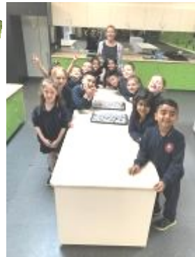
Making tasty Weetbix balls