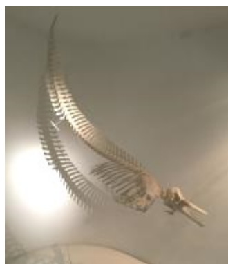
Here are some of the skeletons that we saw in the museum - a shark's mouth and a dolphin skeleton.