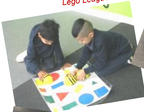
Coding with B-Bots