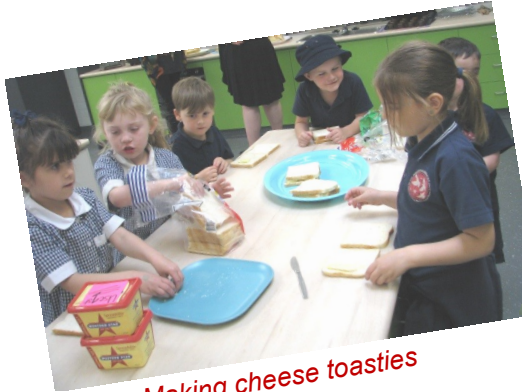
Making cheese toasties