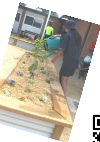
STEM Vegetable Garden planting