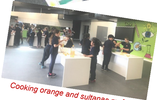
Cooking orange and sultanas muffins