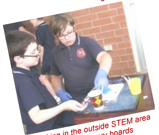
Working in the outside STEM area making sensory boards