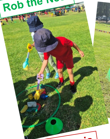
Rob the Nest