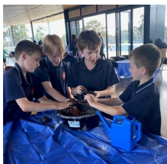
Crafting seed bombs to take home