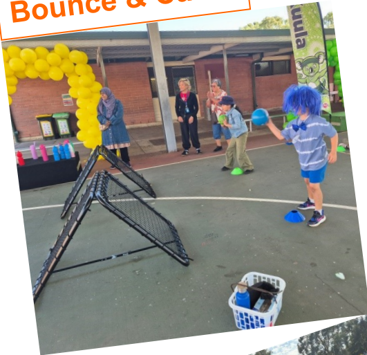
Bounce & Catch