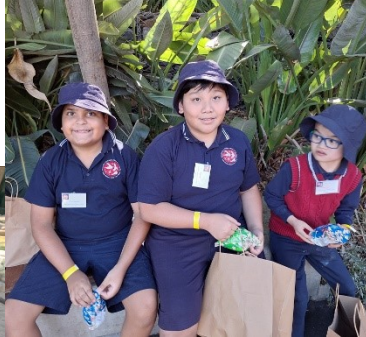
The students had so much fun at the zoo.