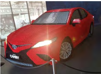
The Lego car - very cool!