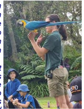
Manu, the blue and gold Macaw getting ready for flight.