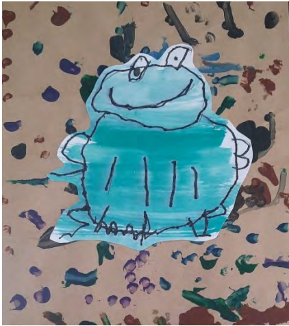
Tiddalick the Frog

The children in Rooms 2 and 5 have been basing their Reconciliation Week activities through Dreaming Stories such as Tiddalick the Frog and the Rainbow Serpent whilst the children in Rooms 3 and 4 having been looking at Land Country and Sea Country books.