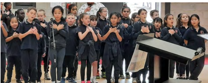
Our Junior Choir along with the Reception students sang 'Peace Over Parafield' for our special guests and the remaining student body, reflecting our Peace School values.