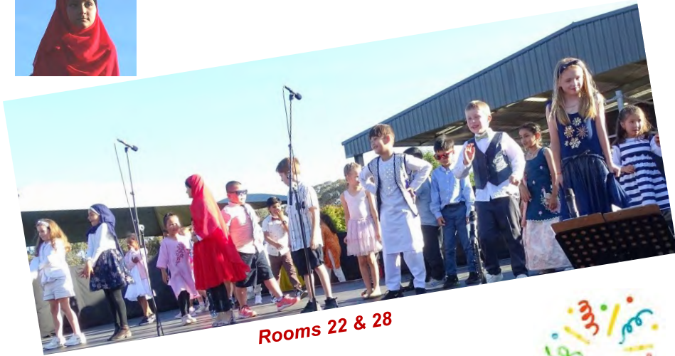
Rooms 22 & 28