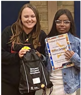
Ashton Room 15