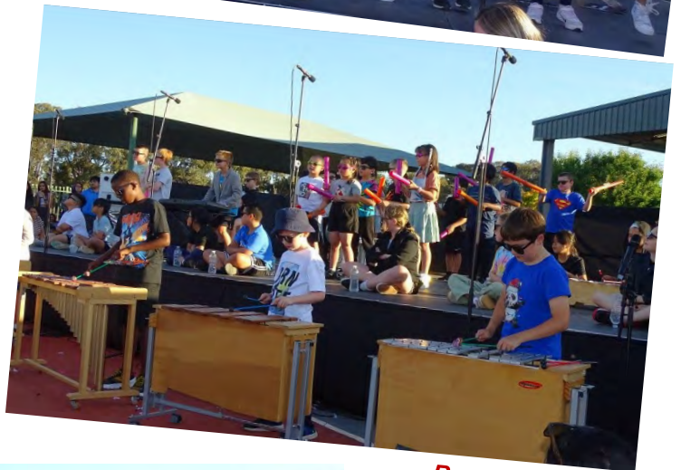
Rooms 7 & 27