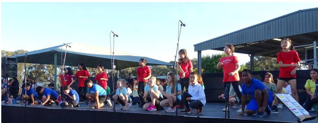
Rooms 30 & 31