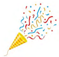
Room 8 & 9