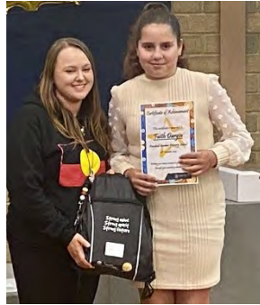
Faith Room 15