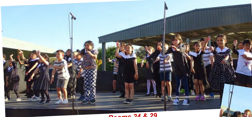
Rooms 24 & 29