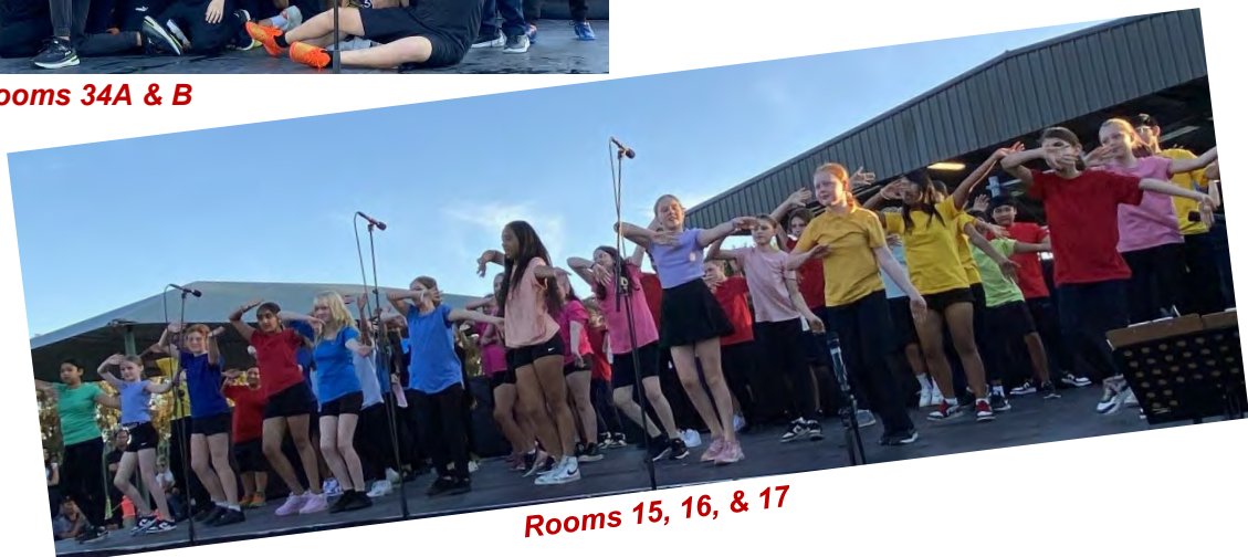
Rooms 15, 16, & 17