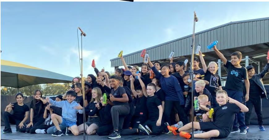
Rooms 34A & B