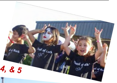
Rooms 2, 3, 4, & 5