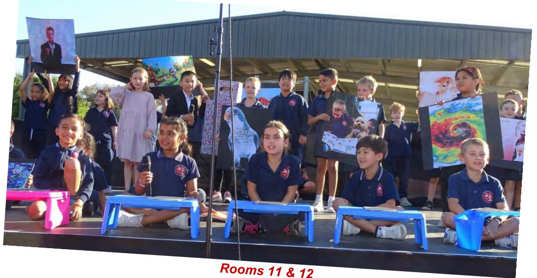
Rooms 11 & 12