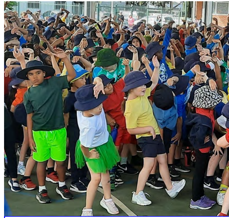
Whole School Health Hustle