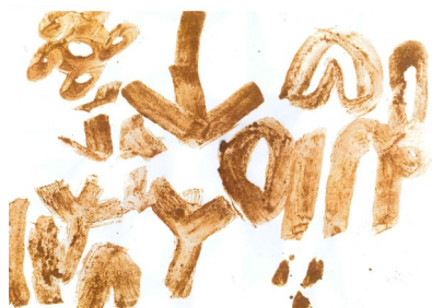
Some of the symbols painted in sand

The Year 4/5 students in Room 33 worked with Year 1 students in their Room 6 PAL class. The students traced around their hands onto coloured card and then wrote thoughtful messages along the fingers of their hands.