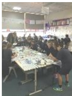
Rubbing the stones to make the sand