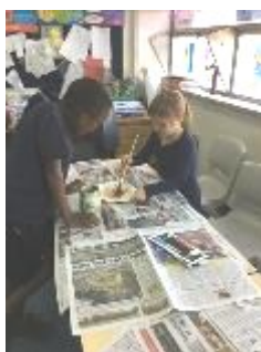
Using the sand to paint symbols