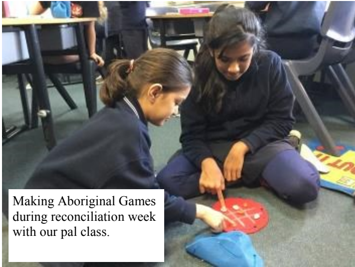
Making Aboriginal Games during reconciliation week with our pal class.