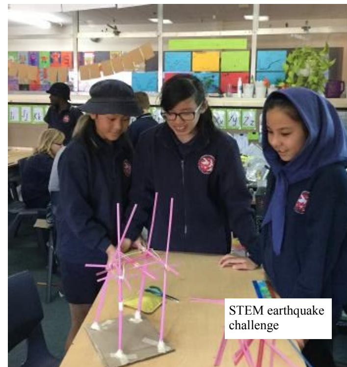
STEM earthquake challenge