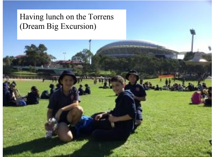
Having lunch on the Torrens (Dream Big Excursion)