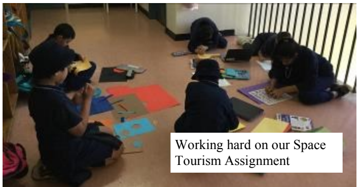
Working hard on our Space Tourism Assignment