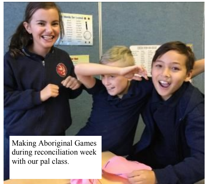
Making Aboriginal Games during reconciliation week with our pal class.