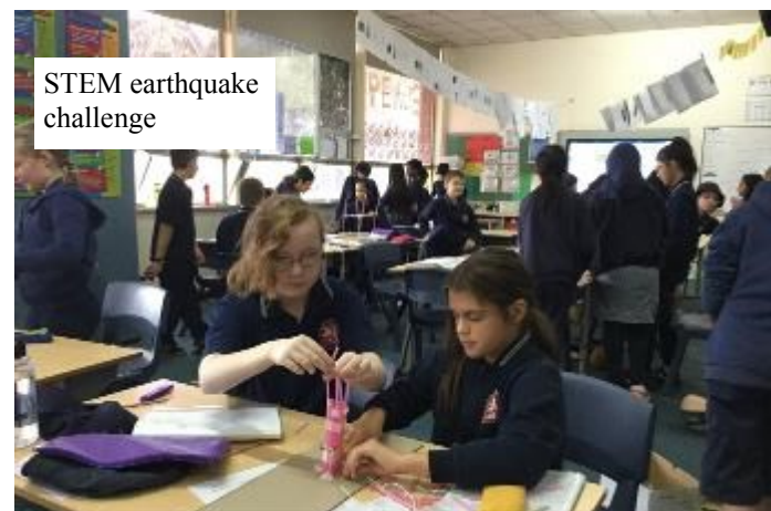
STEM earthquake challenge