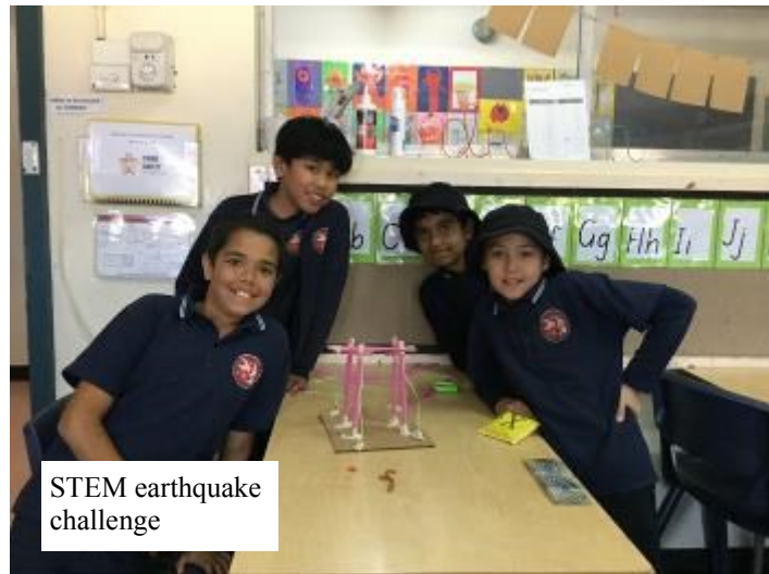
STEM earthquake challenge