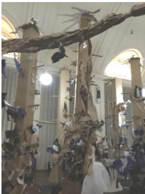
The room was filled with things made from paper and were hanging in 'trees'.