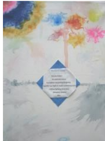
Sarah Room 24

To present my poem I decided to buy a canvas and paint it in two parts - the top section represented the positive point of view so I used lovely bright colours and in the bottom section I used grey and other dull colours so that it appeared sad.