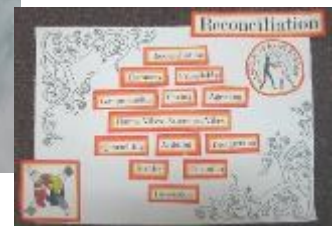
Krisaa Room 24