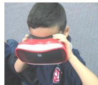
The students using the Virtual Reality glasses

It was so cool. We looked all around and could see lots of different things. We saw the planet and big spirit people. We had to collect things and I saw some eucalyptus leaves. The Aboriginal people used it as medicine and rubbed it onto their skin to heal wounds.