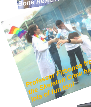
Professor Fitbones from the Skeleton Crew had lots of fun too!