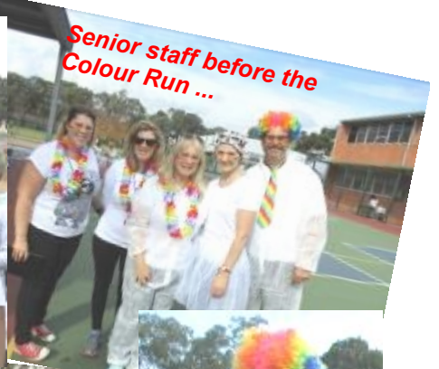
Senior staff before the Colour Run ...