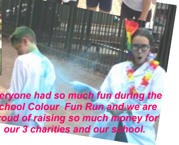
Everyone had so much fun during the School Colour Fun Run and we are proud of raising so much money for our 3 charities and our school.